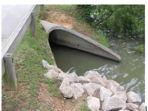
Use Pipe Flared End Section when specified in the