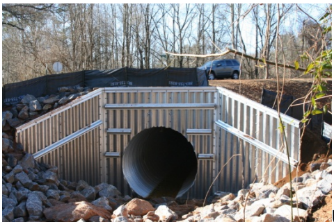
Use Pipe Wingwall